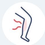
Sprains & Strains