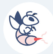
Insect Bites or Stings